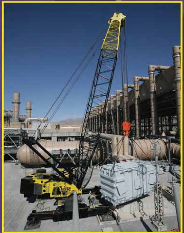
SL-400 Truck Crane Placing Transformer in Power Plant

JAKE'S is highly acclaimed for impressive achievements in the ultra heavy lift field as well. In 1990-91 JAKE'S sponsored the invention and production of the vanguard "SL-400" (Street Legal 400 ton capacity) lattice boom truck crane. In June of 2007, this amazing machine passed the State of California Department of Transportation's (Caltrans) qualifying scrutiny to secure its annual permit for travel on improved roadways with its basic boom in place and fully rigged. This achievement doubled the lifting capacity of any other lattice boom truck crane legally permitted to travel on California highways without un-decking. JAKE'S continues to advance the performance capabilities of this impressive crane.