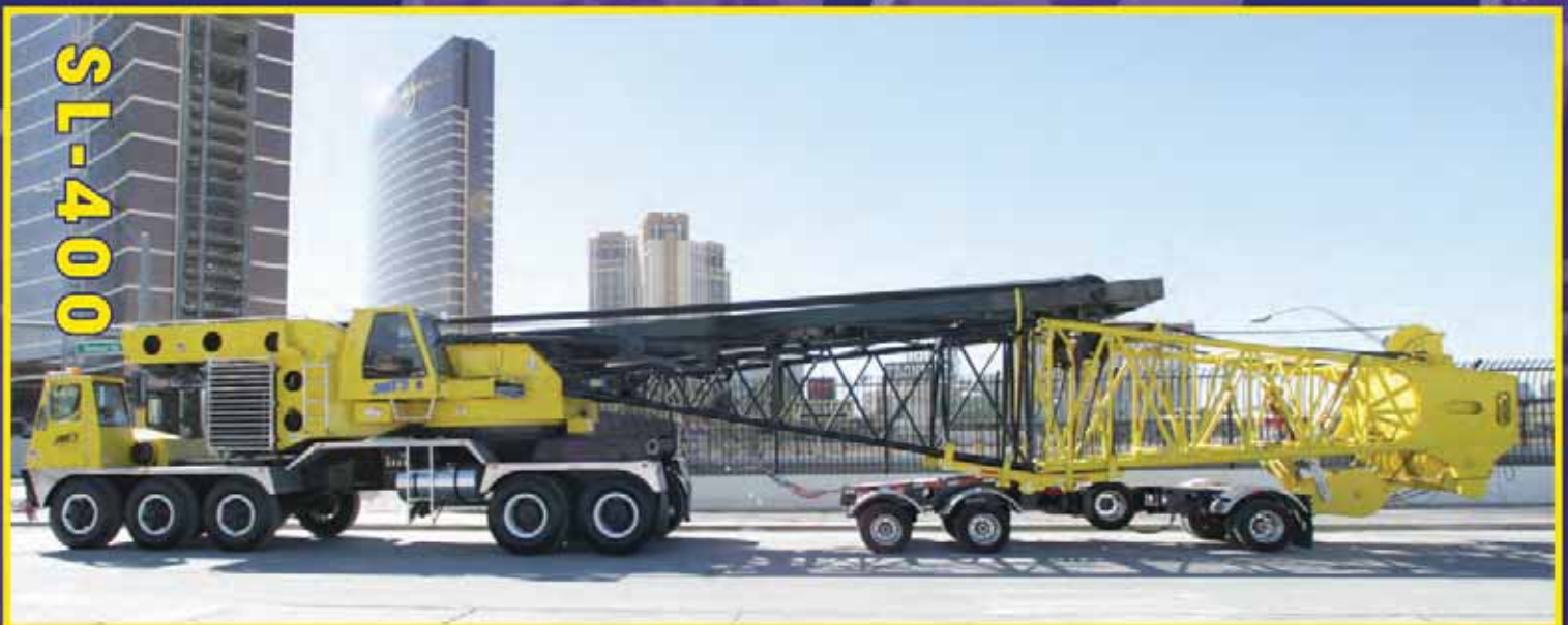
SL-400 Truck Crane Traveling Street-legal on Las Vegas Streets to Jobsite near Wynn Resort