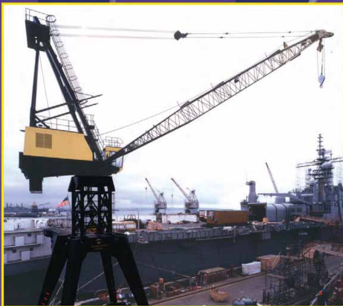
JAKE'S Redesigned Portal-Gantry Crane Mounted on Rails to Straddle a Two-lane Dockside Roadway at San Diego Port