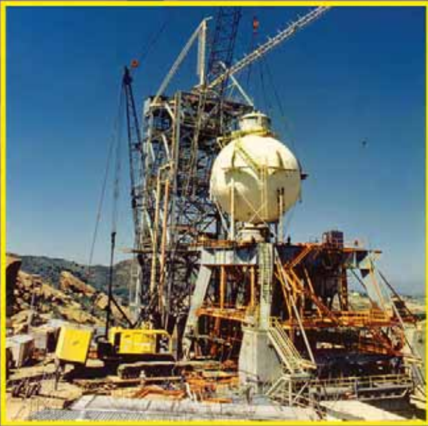
American 9299 Sky Horse Picking, Walking, and Setting 107-ton Spherical Fuel Tank at Rocketdyne Test Stand in California

JAKE'S is renowned for successfully leading highly challenging crane, rigging, and transport endeavors. This company's core enthusiasm for creativity and innovation sustain its reputation as a top industry leader. The JAKE'S teams apply their valuable knowledge and experience in a constant quest to keep advancing the heavy lift and haul technologies to higher levels. JAKE'S goals remain steadfast today – to provide customers with the finest, most advanced, and cost-effective heavy lift and transport capabilities available, now and in the future.